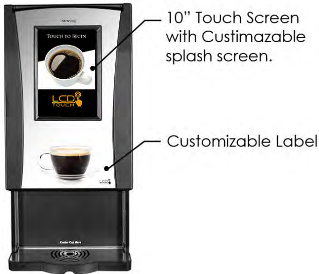
Brandable Splash Screen

LCD Touch's front label and splash screen can be customized with your branding to promote your business.