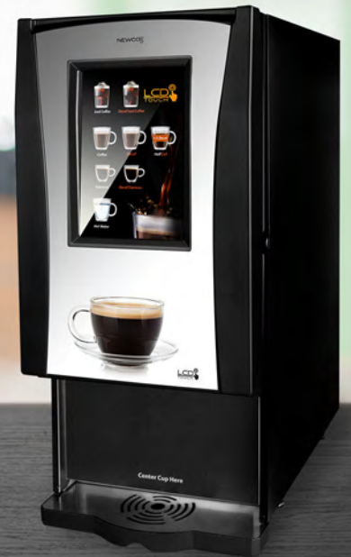
LCD Touch PN: #122100

Elevate your on-demand coffee program with Newco's LCD Touch dispenser. The engaging and intuitive touch screen allows consumers to easily choose and customize their beverage. There is no brewing required saving on labor and little to no waste as each cup is freshly prepared at time of selection. Whether its coffee, espresso or iced coffee; the LCD Touch will consistently deliver the drinks in a matter of seconds vs. minutes. The ability to deliver high quality BIB coffee is great way to satisfy locations that need fresh coffee any time of the day without the labor and time requirements of fresh brewed coffee.