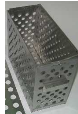
Part Number: 805156, Top Sieve SS Rectangular