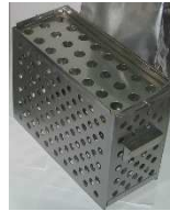
Part Number: 805151, Sieve & Handle Assembly Rectangular