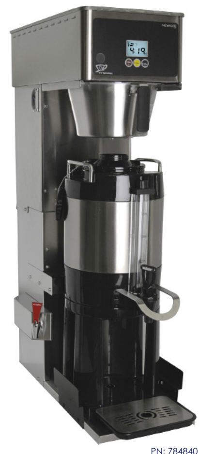
FN: 784640 STVT Combo with Silde Out Shown Above: with a 1.5 Gallon Vaculator Thermal Server with base and drip tray