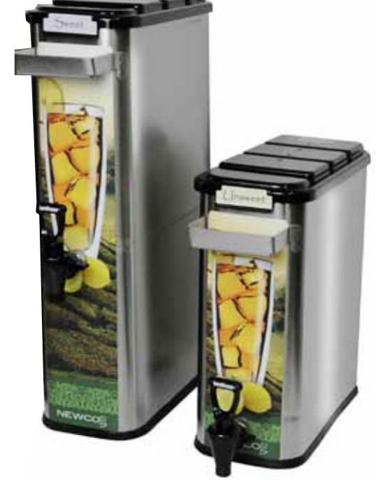
3.5 Gallon Tall PN: 805011