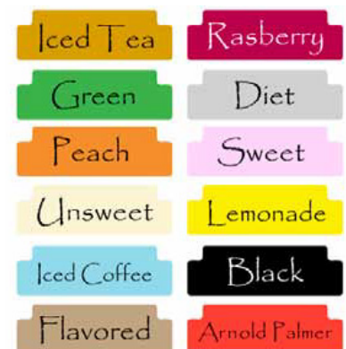
3.5 Gallon Short PN: 805010