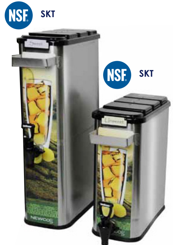
3.5 Gallon Tall PN: 805011